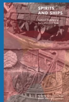
Spirits and Ships: Cultural Transfers in Early Monsoon Asia

ISEAS Publishing is a dynamic press with more than forty years' experience. It is the largest publisher of academic books that focuses on Southeast Asian politics, economics and social issues. As a Unit of the ISEAS-Yusof Ishak Institute in Singapore, its role is enshrined in Parliamentary Act 9 of 1968, to assist ISEAS in the promotion of research on Southeast Asia worldwide.