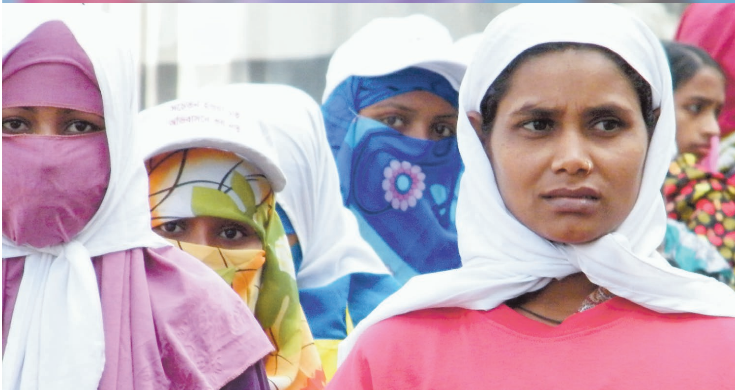
Above: Protestors against gender violence, India.

The other dilemma is that while the human rights approach has succeeded in eliciting a state response to domestic violence, criminalisation must also include preventive and protective support measures. However, there is still scant recognition that violence is intrinsically related to gendered inequality between men and women, a conceptual flaw that would need to be addressed all over the world.