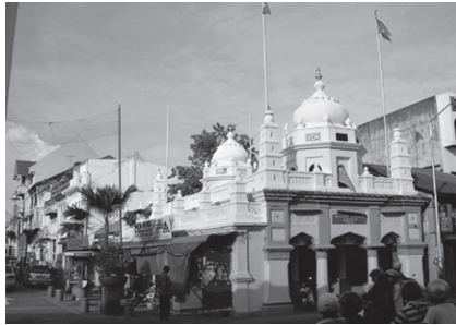
Nagore Sufi-shrine dating from 1801

George Town, the capital of Penang, Malaysia, is now a World Heritage Site. How it was built and the way it should be conserved or developed are issues constantly contested as part of a discussion on the extent to which it is possible to acknowledge the contributions of diverse peoples, mostly migrants. The 'Historic Cities of the Straits of Malacca', comprising the former British Straits Settlements ports of George Town and Melaka, were jointly listed by UNESCO in July 2008. Melaka dates from 1400 and has seen Portuguese, Dutch and British rule, whereas George Town, Penang, dates from 1786 and flourished in the era of British expansionism. Both cities illustrate the co-evolution of Asian family business and the shop-house form in Southeast Asia. The attainment of world heritage status for George Town was partly due to long-term, bottom-up lobbying by the Penang Heritage Trust and the arts education group Arts-Ed, as well as private conservation efforts. The listing is now celebrated with a month-long George Town Festival in July.