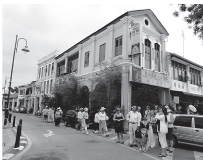
Cultural tourism at Armenian Street

Conservation is a challenge in a city that is under-regulated and hungry for private investment. At least now, the state leadership accepts that the city's 'Outstanding Universal Values' have to be protected. The first OUV is the city's built heritage or townscape consisting of several thousand double-storey shop-houses, studded with an East India Company fort, religious monuments, townhouses and bungalows, public buildings and mercantile offices. A special area plan for the two sites was drawn up in fulfilment of UNESCO requirements, but the semi-government George Town World Heritage Incorporated has lasting difficulty in employing architectural heritage expertise at local salaries to carry out monitoring and advisory functions. Furthermore, lax urban management has resulted in the proliferation of illegal swift-breeding, a threat that has depopulated entire historic towns across Southeast Asia.