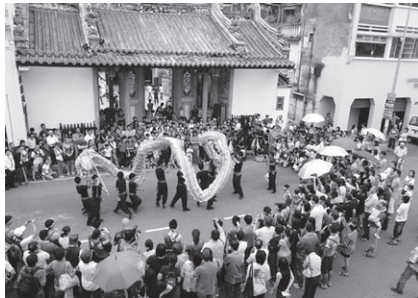
Dragon dance in front of the Teochew Temple