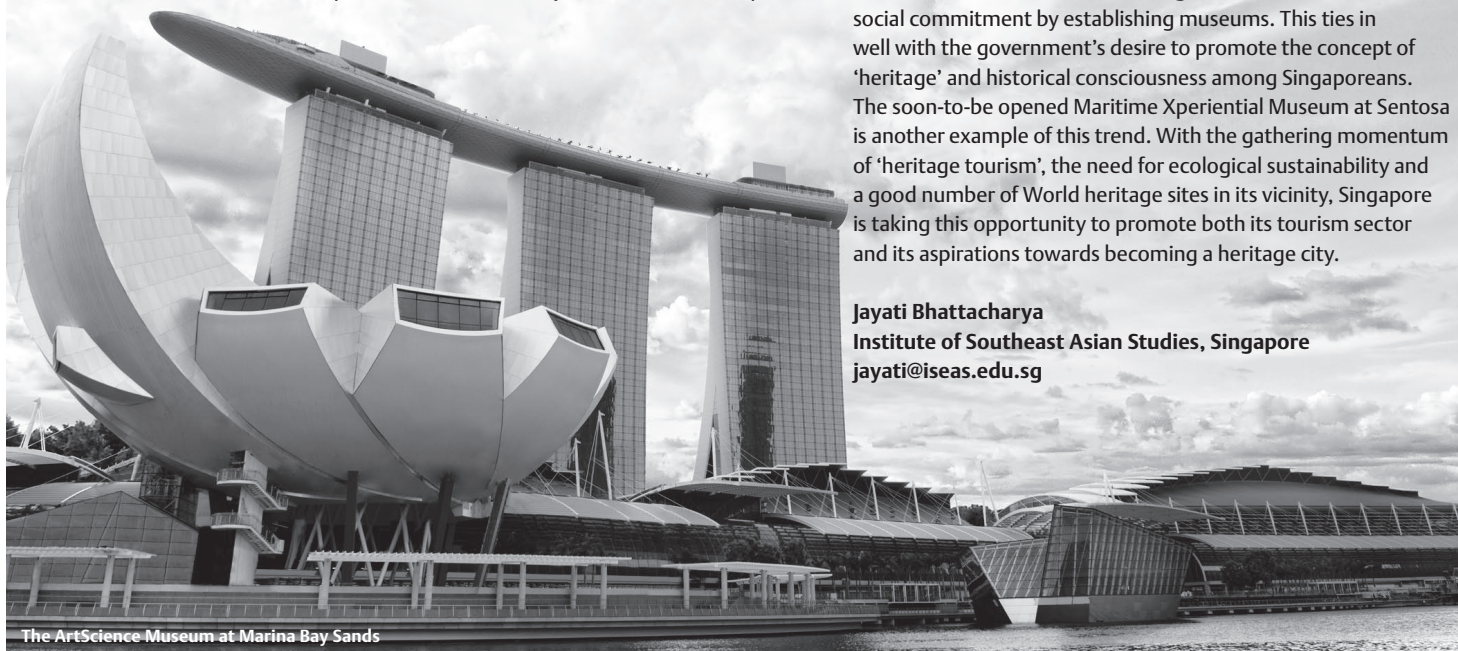
The ArtScience Museum at Marina Bay Sands