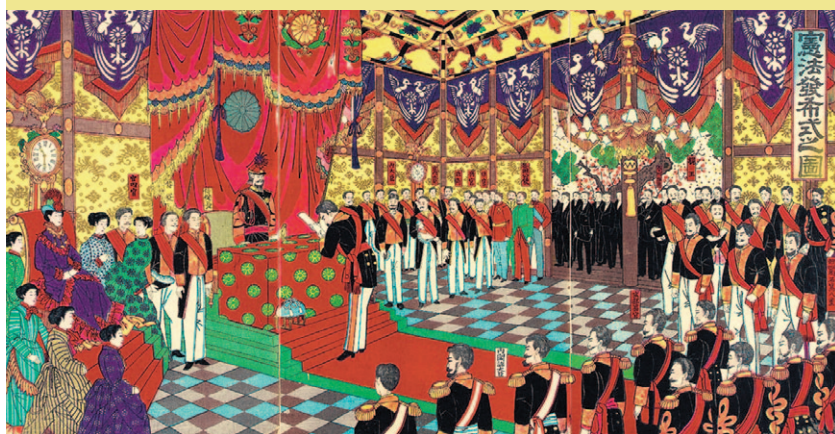
Below: Illustration of 'The Ceremony Promulgating the Constitution', Artist Unknown. 1890.

The nature of Japanese political modernity then (what some would call its 'success'), was influenced not so much by the extent or lack of its conformity to Western models, as by the extent of parallel between political outlooks—something determined equally by the earlier parallel development of both societies and also informed and affected by their bordering regions.