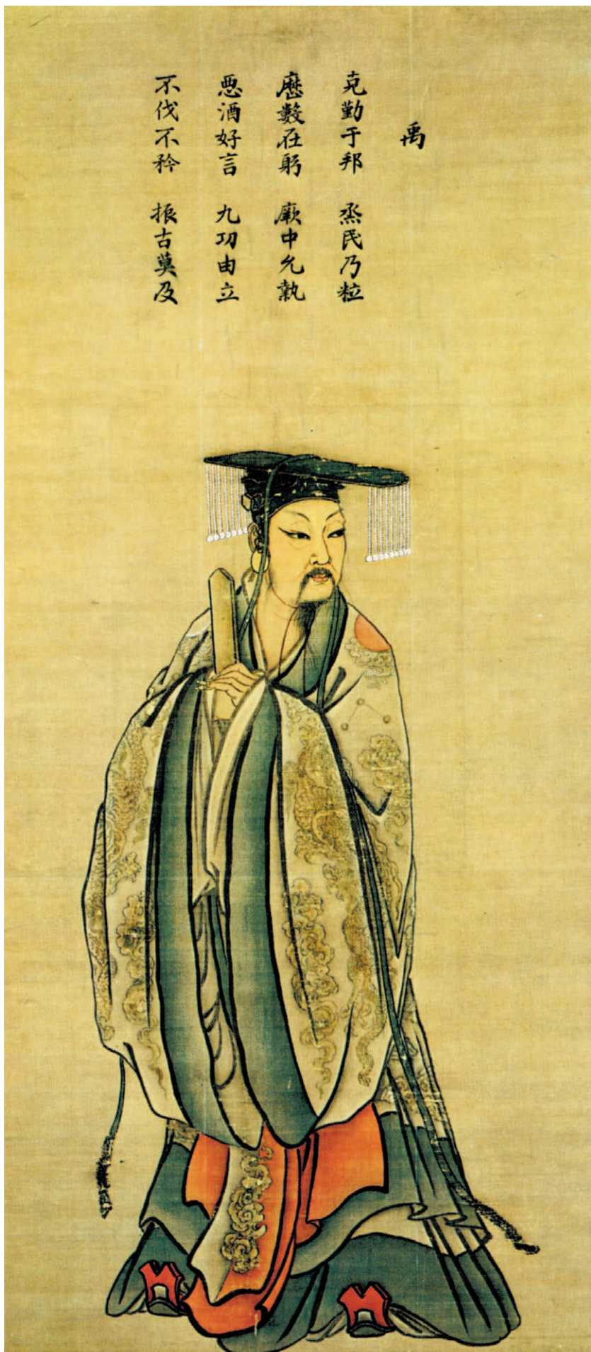
Above: Yu the Great, one of the legendary Three Sage Kings. As imagined by Song Dynasty painter Ma Lin (馬麟). Painting is located in the National Palace Museum, Taipei. Tokugawa Confucian thinker Ogyū Sorai (1666-1728) believed that Confucian truth was to be found in the historical truth of the rule of the 'Ancient Sage Kings' of Chinese antiquity—pre 700AD.