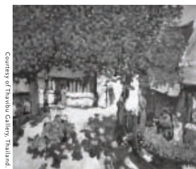
Thanh Van, 'Flower Market', 2001. Oil on canvas, 80 x 94 cm.

The Silom Galleria Building, 3rd Floor Suite 308, 919/1 Silom Rd., Bangkok 10500, Thailand Tel: +66-2-266 5454 Fax: +66-2-266 5455 E-mail: info@thavibu.com http://www.thavibu.com