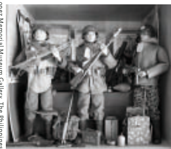
Raymond Red Collection, 'Toy Collection', installation.

Benpres Building Mealco Avenue cor Exchange Road, Pasig E-mail: pezseum@skynet.net Website: http://www.lopezmuseum.org.ph